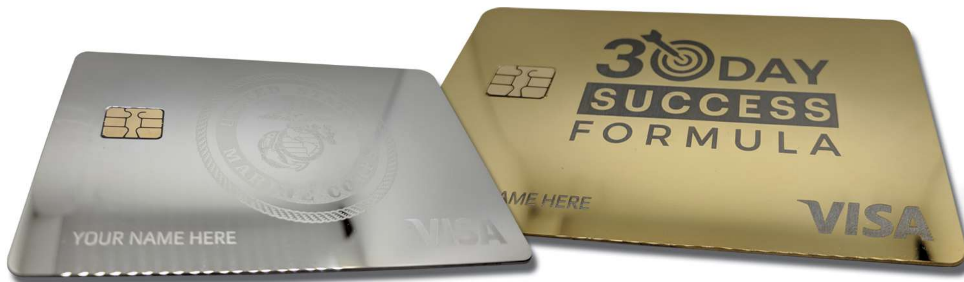
(We can personalize your card any way you like)

Earn additional income when your team purchases any of our products!